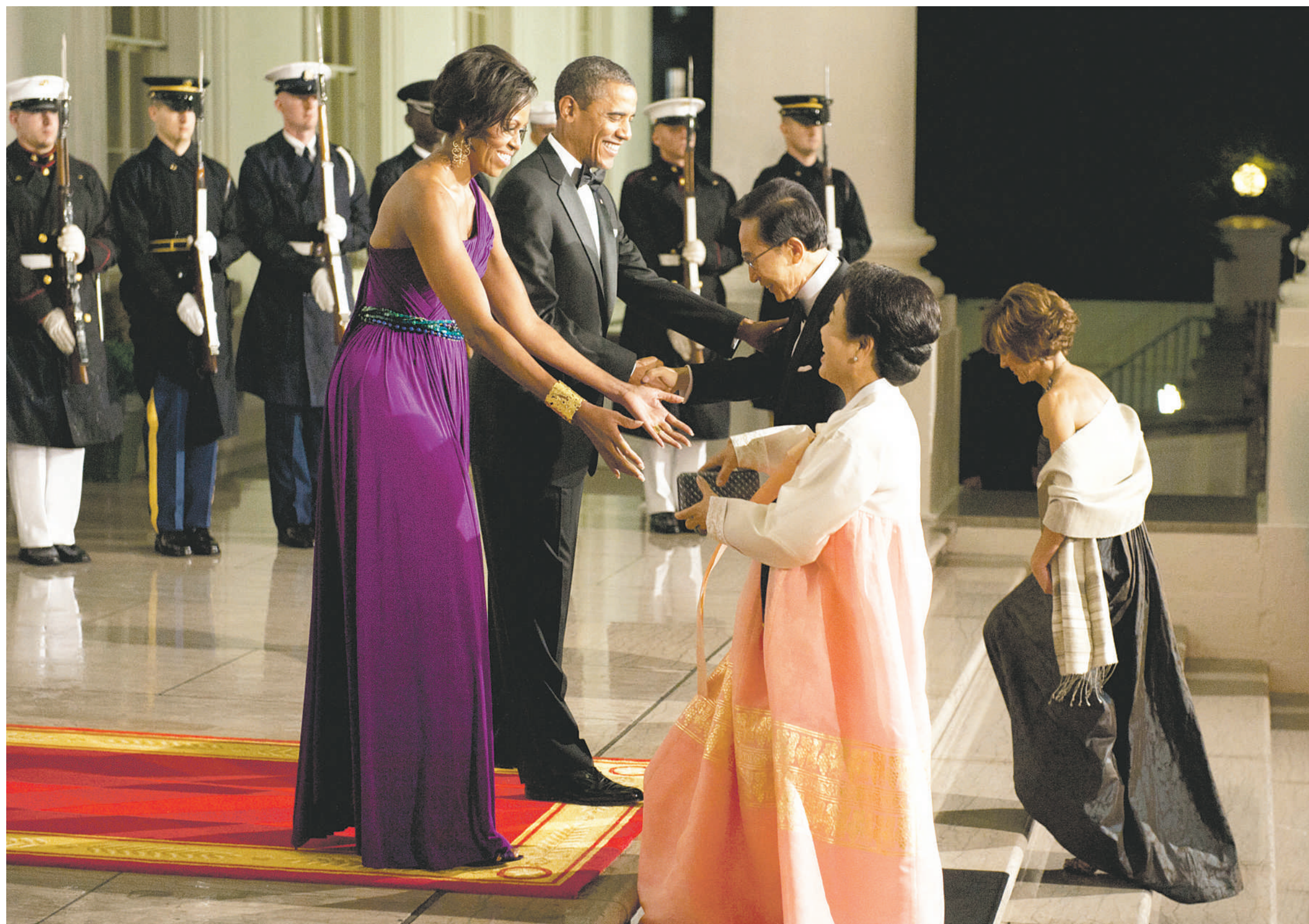
WELCOME PARTY: President Obama and first lady Michelle Obama greet South Korean President Lee Myung-bak and first lady Kim Yoon-ok at the North Portico of the White House.